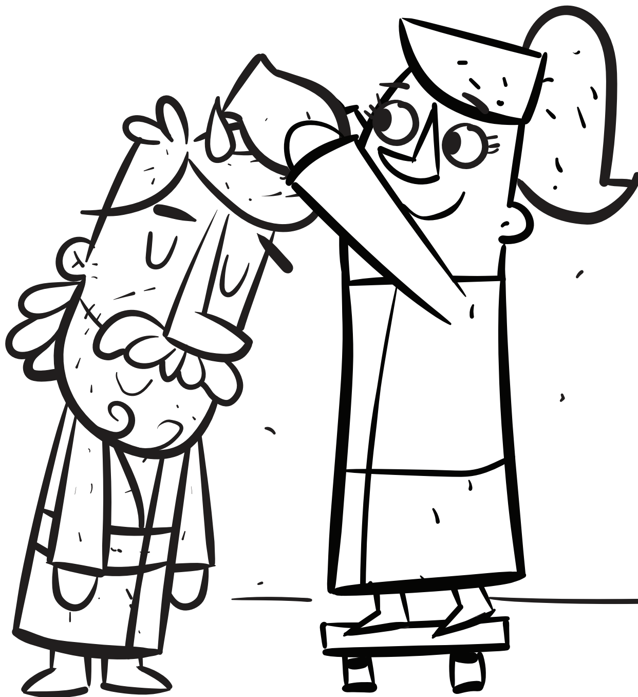
Jesus is Anointed at Bethany Matthew 26:6-13 and Mark 14:3-9