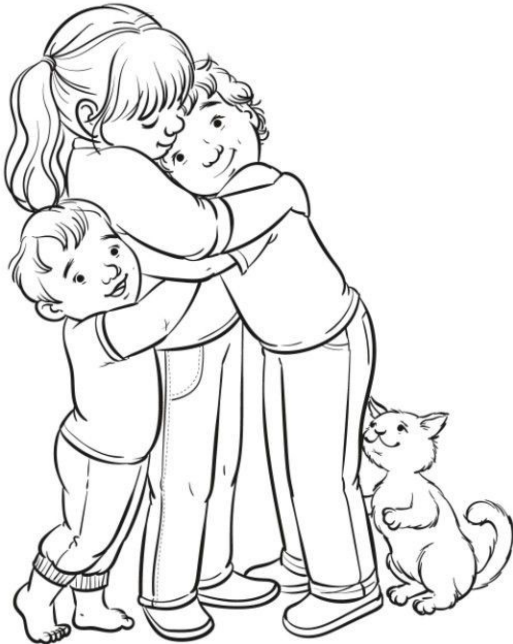
ILLUSTRATION BY ADAM, 1997