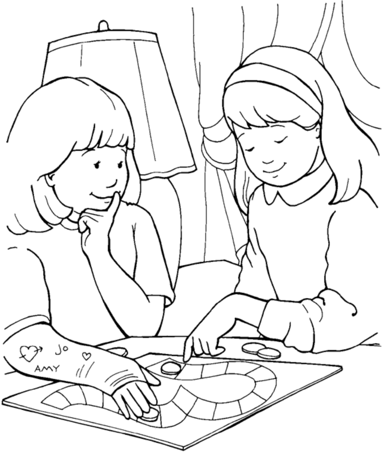
Showing Kindness Toward Others